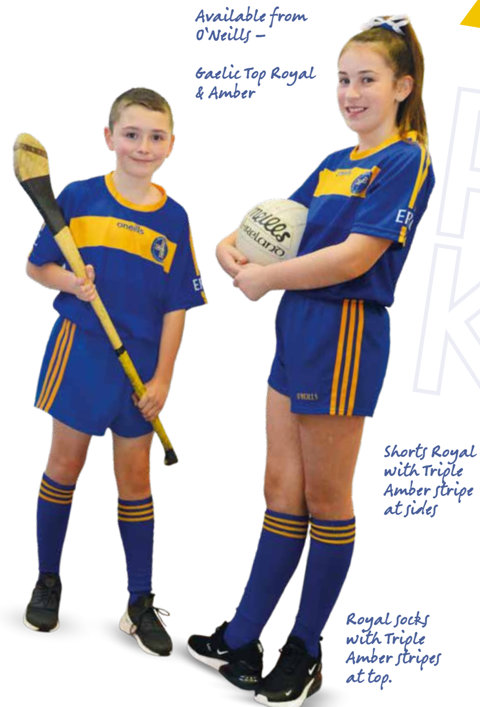
Available from O'Neills -