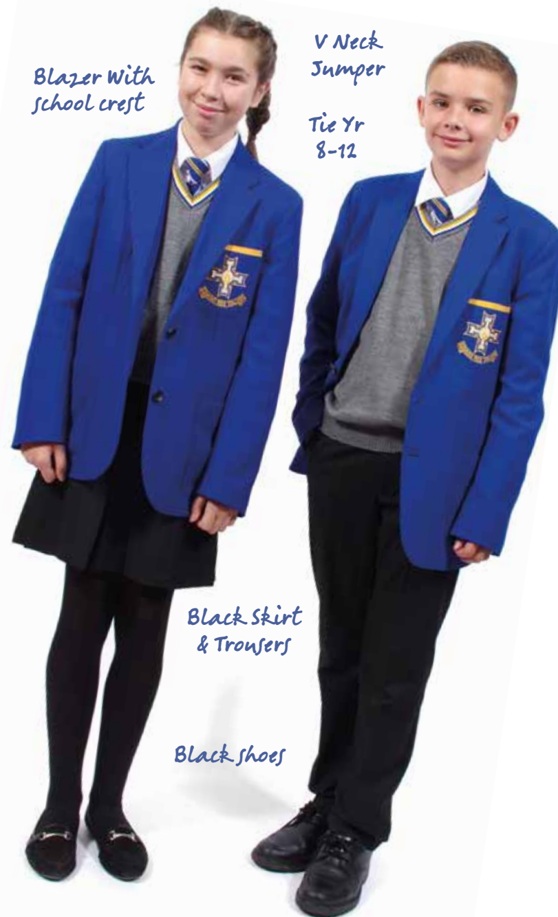
Blazer With school crest